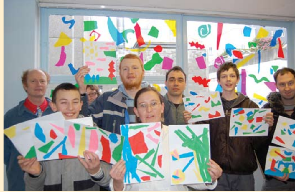
'Skills for Life' outreach window at the Falmouth Marine School

The wider community has been involved throughout the project, through talks, tours, and workshops - creating their own designs. Participants included families, special needs groups, Age Concern, Falmouth Stroke Club, nursing homes, students, schools and community groups. The 'Skills for life' classes at Falmouth Marine School also created designs for their own stained glass window outside their classroom. Gallery staff installed their designs using brightly coloured window film. All of the project participants were invited to fun filled community launch parties to celebrate the completion of the project.