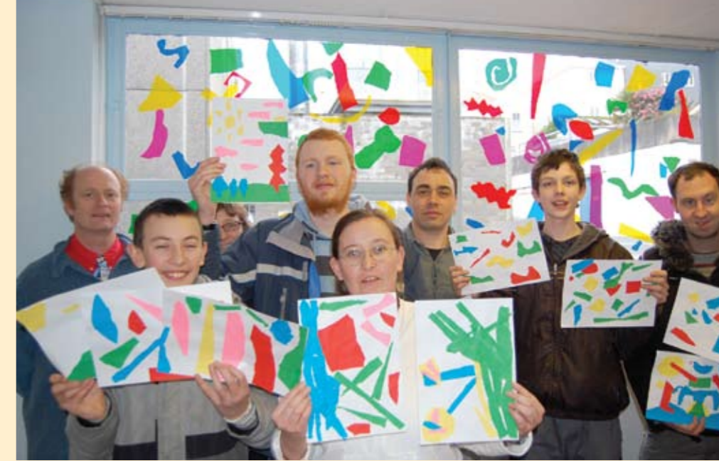
'Skills for Life' outreach window at the Falmouth Marine School

The wider community has been involved throughout the project, through talks, tours, and workshops - creating their own designs. Participants included families, special needs groups, Age Concern, Falmouth Stroke Club, nursing homes, students, schools and community groups. The 'Skills for life' classes at Falmouth Marine School also created designs for their own stained glass window outside their classroom. Gallery staff installed their designs using brightly coloured window film. All of the project participants were invited to fun filled community launch parties to celebrate the completion of the project.